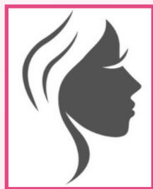
This could be YOU