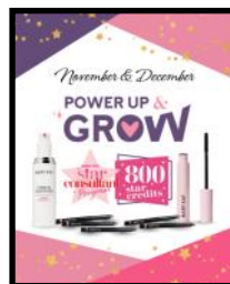
Your Turn to Shine