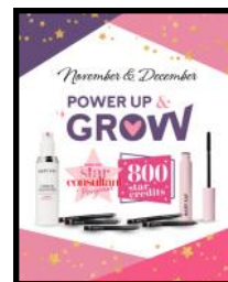
Your Turn to Shine